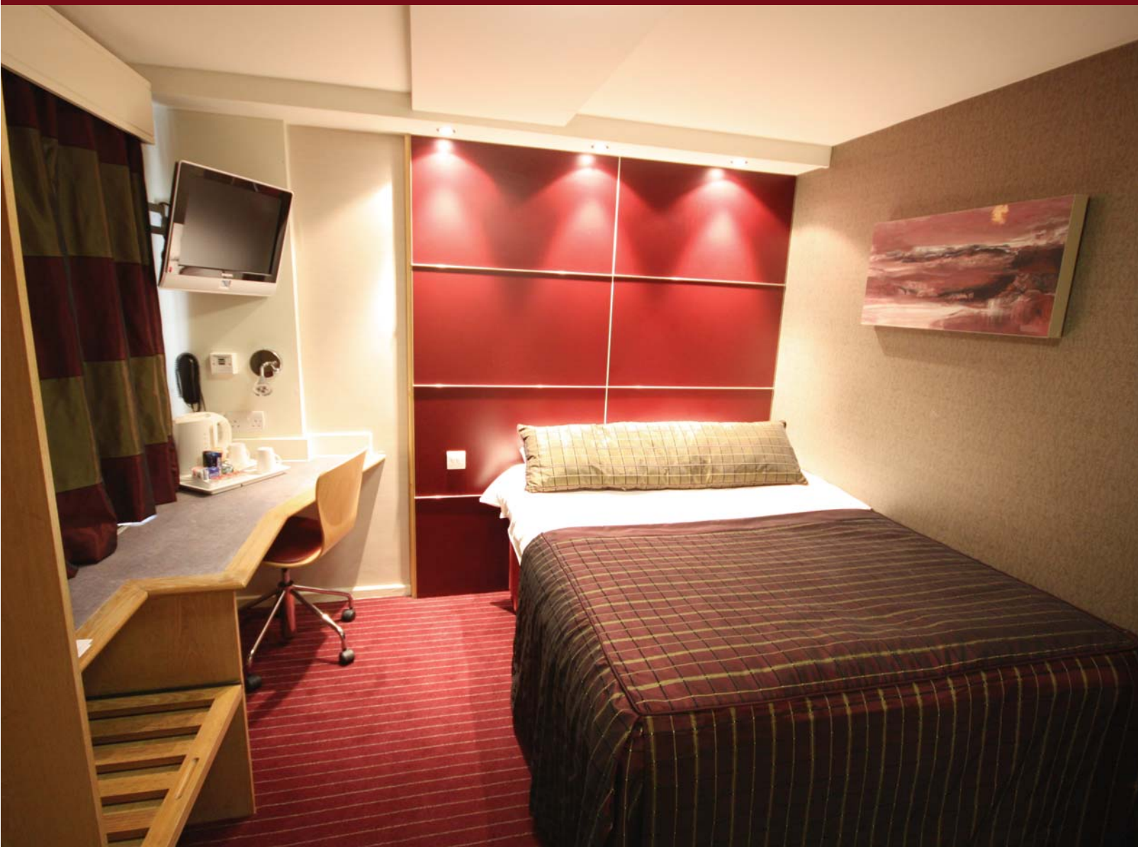
On-site 3* Accommodation