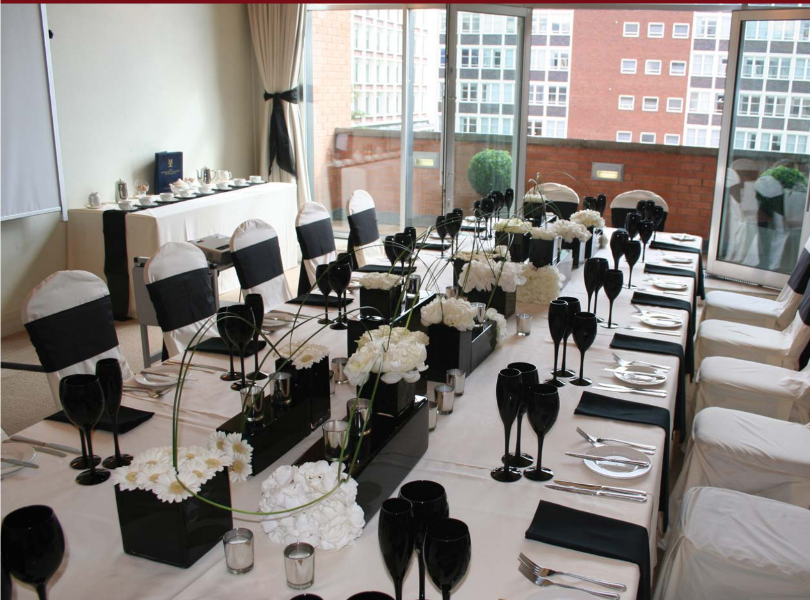
Boardroom Level 6