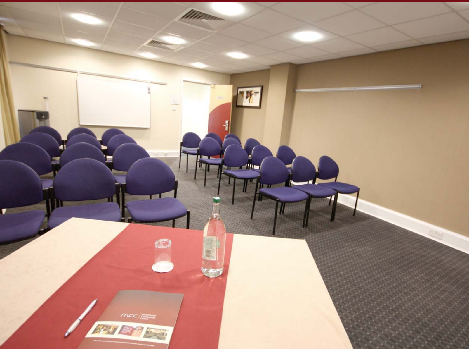
Conference Room 2